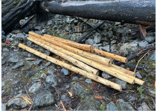
Little North Fork Santiam River

Single stringer bridge in progress, cedar cut, hauled to the site, and stripped with draw knives for railing (next phase of the job)